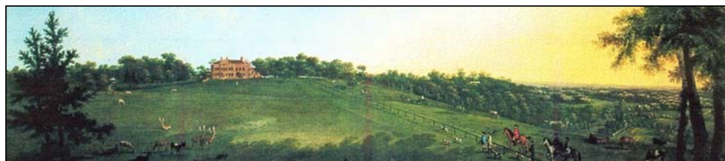
Bolderwood in the 18th century

the Vicar of Boldre from 1777 to his death in 1804 wrote and illustrated a book, Remarks on Forest Scenery... that showed a fresh understanding of landscape for itself - a concept then unheard of.